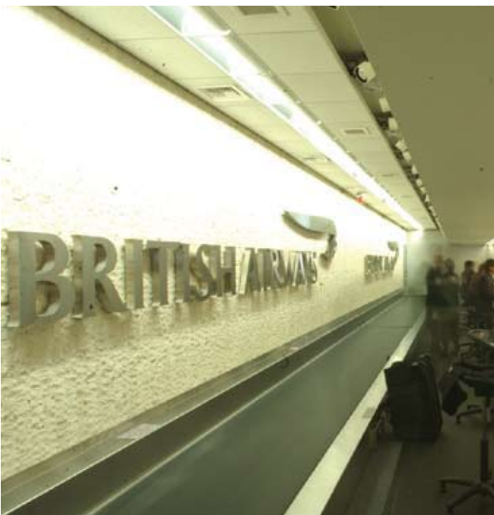
Custom fabricated stainless steel letters

The entire way finding signage for the British Airways Terminal was fabricated in the shape of an airplane wing with graphics on both sides.